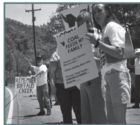
Volunteers with Mountain Justice Summer gather in front of Marsh Fork Elementary school then march to the gates of Massey Energy.

agreed to eliminate 80 percent of their methyl isocyanate (MIC) stockpile at their plant in Institute. The company announced the plan just two days before the one-year anniversary of the August 2008 explosion and fire that killed two workers. Despite these reductions, the group is concerned that more MIC will still be stored at this plant than at any other plant in the nation. In 1984, a leak of MIC killed thousands of people who lived near a similar plant in Bhopal, India. After this accident, other companies around the world eliminated large-scale MIC storage except for the Bayer facility in Institute.