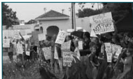
Residents rally against Big Fertilizer in Rockledge, FL.

Save Our Aquifer , the Space Coast Progressive Alliance , the Sierra Club and others celebrated when the Rockledge City Council voted to keep strong the fertilizer ordinance that it passed earlier this year. The