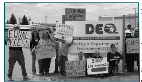
Residents in the Upper Peninsula, MI call for investigation.

The suspicious activities of a newly formed "non-profit" corporation, the Northern Michigan Geologic Repository Association based in Marquette County, are being questioned by local residents and organizations. Keweenaw Bay Indian Community tribal members, Concerned Citizens of Big Bay , and Save the Wild UP are calling for the Department of Justice to investigate the creation of this so-called non-profit organization which consists of Rio Tinto (a large mining corporation) executives and local government officials, and was created at the same time that the planning and construction of the local Eagle Rock mine took place. Poor regulation and other questionable practices have prompted the request for this investigation. The groups with other concerned citizens held a demonstration near the Michigan Department of Environmental Quality Upper Peninsula office outside Marquette with signs calling for the investigation (see photo below).