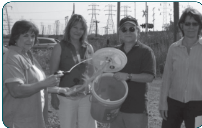
Tonawanda residents preparing to collect air samples using a homemade bucket.

CAC organized a general assembly where over a hundred residents brainstormed ideas on how to best spend the money. They organized follow-up meetings to flush out project ideas, create budgets, secure letters of support and create a ballot that residents voted on. The projects that got the most votes were then submitted to the federal government as recommendations from the community on how to spend the settlement money. Proposed projects included community gardens, a neighborhood relocation