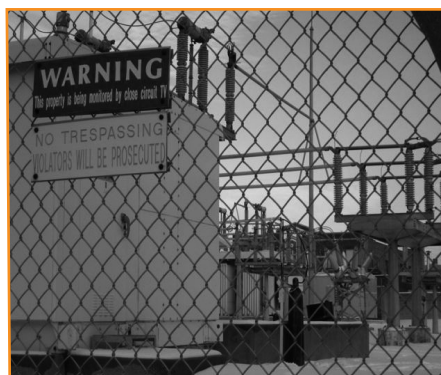
KCP&L substation at 19th Street and Cherry in Kansas City, MO.

Residents on the west side of Kansas City are concerned about plans by Kansas City Power & Light to build a second substation in their neighborhood. Westside Community Acton Network (WCAN) has been working hard to make improvements in their neighborhood and they feel that this project is not the kind of development they want. There already is a substation in the neighborhood that prospective businesses and residents shy away from (see photo below) and the group feels that another substation will be more of the same. WCAN also says that there are already too many pollution sources in the neighborhood and it's time for the neighborhood residents to decide the fate of their neighborhood. CHEJ is providing organizing support.