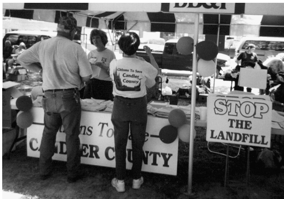
In Georgia, Citizens to Save Candler County held a “Day in the Park” with music and food, generating a great turnout.

◆ Committee for a Clean Environment (CCE) continues to fight to prevent an open dump (“confined disposal facility” or CDF) from being sited near two schools in a Latino community in East Chicago. The dump would be used for the contaminated sediment being dredged from the Indiana Harbor Ship Canal. After CCE had collected 3,000 signatures against the proposal, U.S. Representative Visclosky sent out a letter to everyone who had signed the petition, dismissing their concerns. CCE replied to Visclosky and also sent a mailing to all 3,000 signers. At a well-attended public forum on the CDF sponsored by the Indiana University Environmental Justice Partnership, the Army Corps of Engineers took the lead in favor of the CDF, with CCE speaking against the proposal. As a result of the forum, the EPA announced that it would consider amending the project’s original risk assessment. Another positive development is that a CCE member has been appointed to the East Chicago Waterway Management Board, which has oversight of the dredging project. The board now complies with open meeting requirements and has