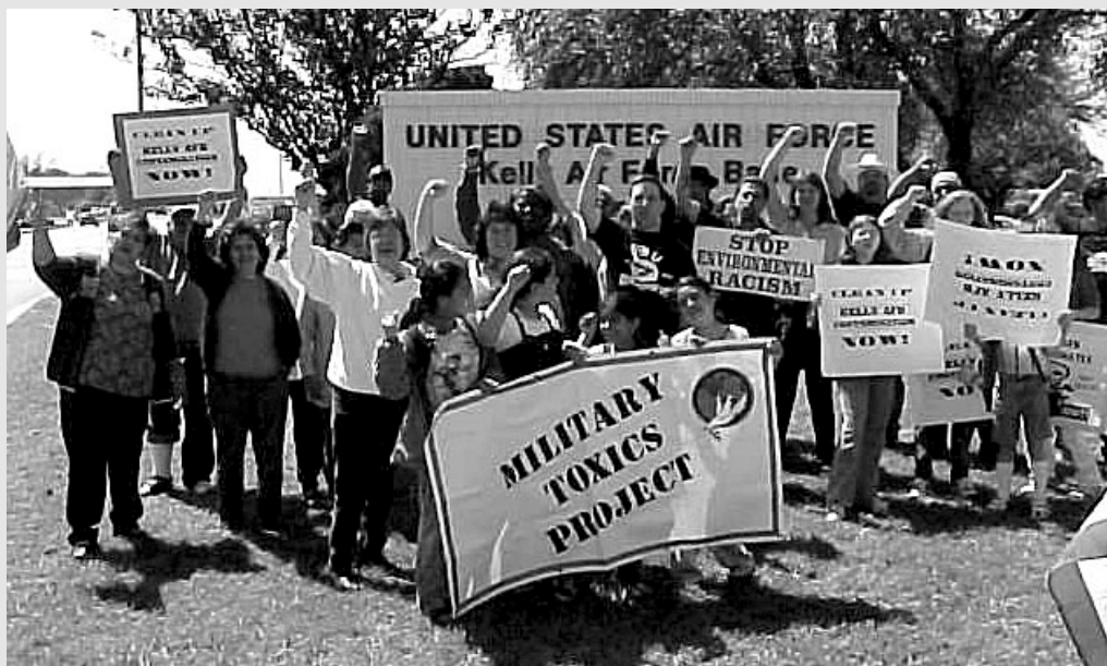
Outside Kelly Air Force Base in San Antonio last year.