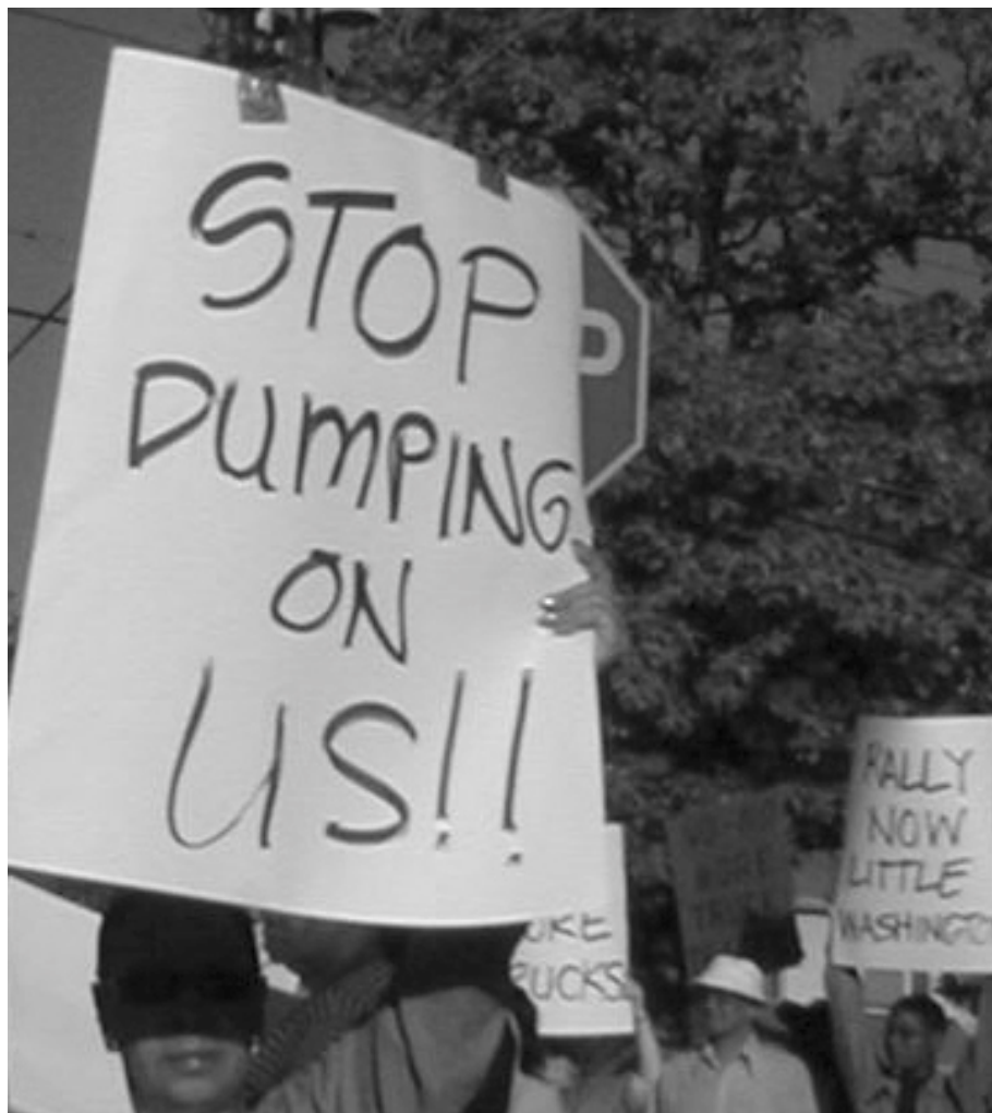
Protest against truck traffic led by the Little Washington Civic Association in Maryland drew 200 residents in September. Photo courtesy of Darryl Harris of the Little Washington Civic Association.

◆ Residents formed Concerned Citizens of Athens (CCA) to take action against a biomass facility after noxious smoke from the plant caused asthma attacks, headaches, irritated eyes and lungs, and dizziness. The plant, run by Boralex, was burning demolition debris, including PVC plastic, asbestos, and lead-based paint. CCA demanded the plant sort out PVC and other potentially toxic materials. As the result of community actions—including a large protest and media event outside the facility's gates—and state pressure, the plant has agreed to stop burning demolition waste and has temporarily shut down. Citizen efforts have not stopped there, however. The group is moving forward with a local air quality ordinance to ensure the protection of public health against future toxic threats. Contributed by Toxics Action Center