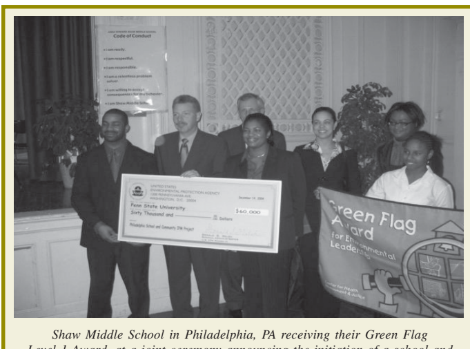
Level I Award, at a joint ceremony announcing the initiation of a school and community Integrated Pest Management (IPM) program.

In Arnold, MD, Broadneck Elementary students and staff started the school's first recycling program. Beginning with paper recycling, students learn why it's important, how it's done, and measure their success with a larger than life thermometer displayed in the cafeteria...In Falls Church, VA, the City Recycling Coordinator is using field trips to waste facilities to support recycling lesson plans. This innovative and enthusiastic coordinator is initiating Green Flags in two elementary schools, hoping to energize environmentally sensitive students who might someday initiate their own environmental clubs in middle and high school...in Newark, DE, students are beginning their own recycling program after being inspired by the success of the nearby Douglass Alternative School...in Jupiter, FL, students learned about indoor air quality problems caused by aerosol products and created a video DVD to educate their school on the issue. They subsequently passed a "No Aerosols" policy at the school and have begun working on a new recycling project...in Westtown, PA, high school students have taken the program by storm, researching four project areas and meeting with the school's